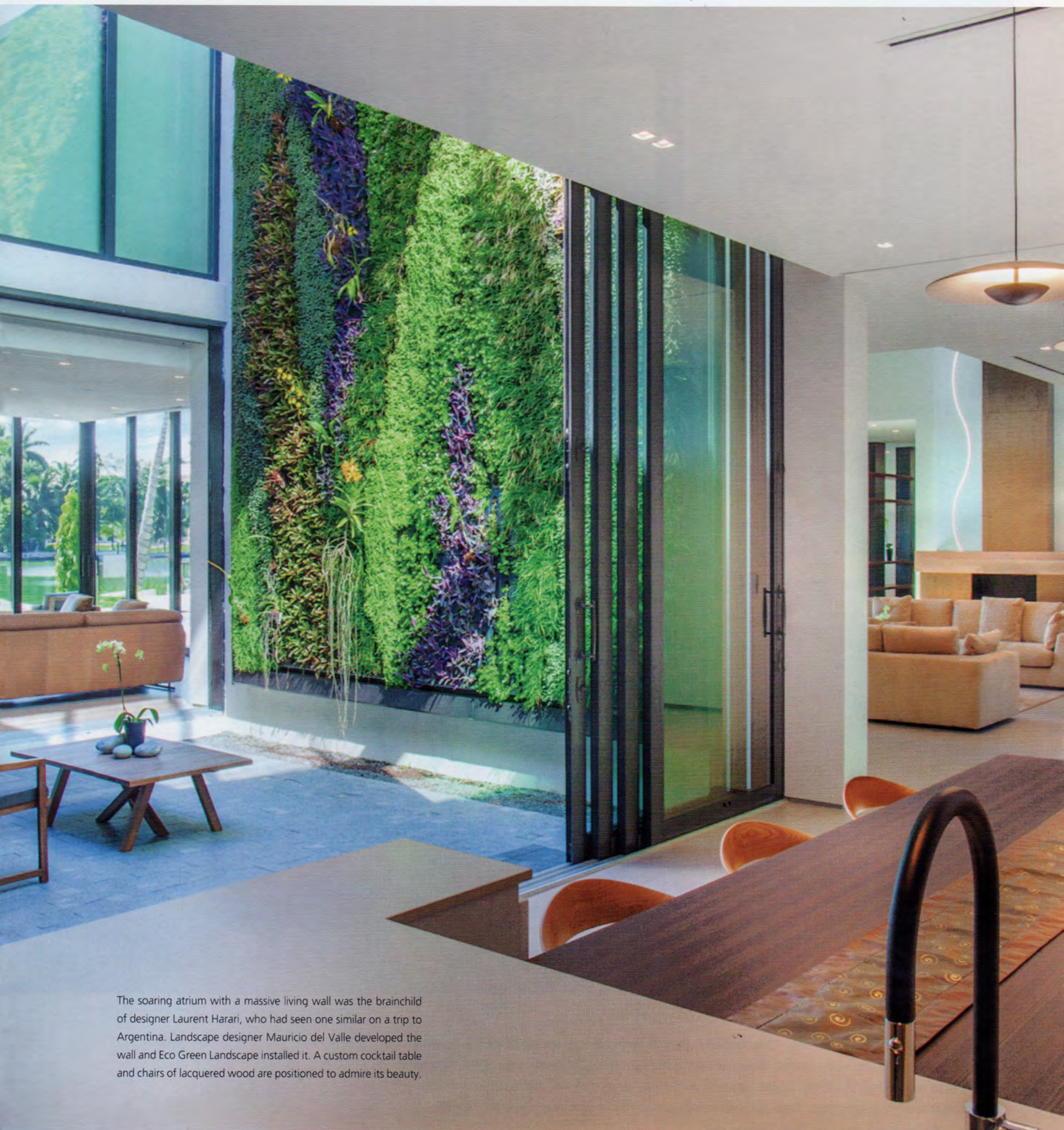
The soaring atrium with a massive living wall was the brainchild of designer Laurent Harari, who had seen one similar on a trip to Argentina. Landscape designer Mauricio del Valle developed the wall and Eco Green Landscape installed it. A custom cocktail table and chairs of lacquered wood are positioned to admire its beauty.